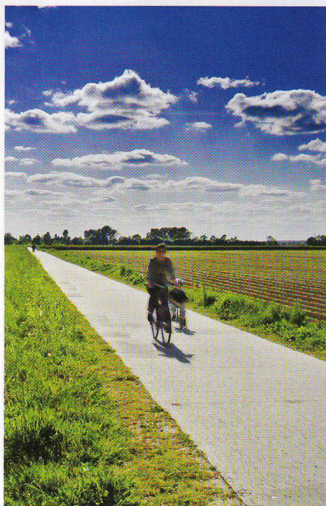
From left to right What could be more French than cycling?; the Château de Villandry; typical Loire boats