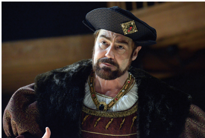
Step back in time with the Royal Shakespeare Company's latest shows, Bring Up The Bodies (p. 46) and Wolf Hall (p. 48), which are playing at the Aldwych Theatre