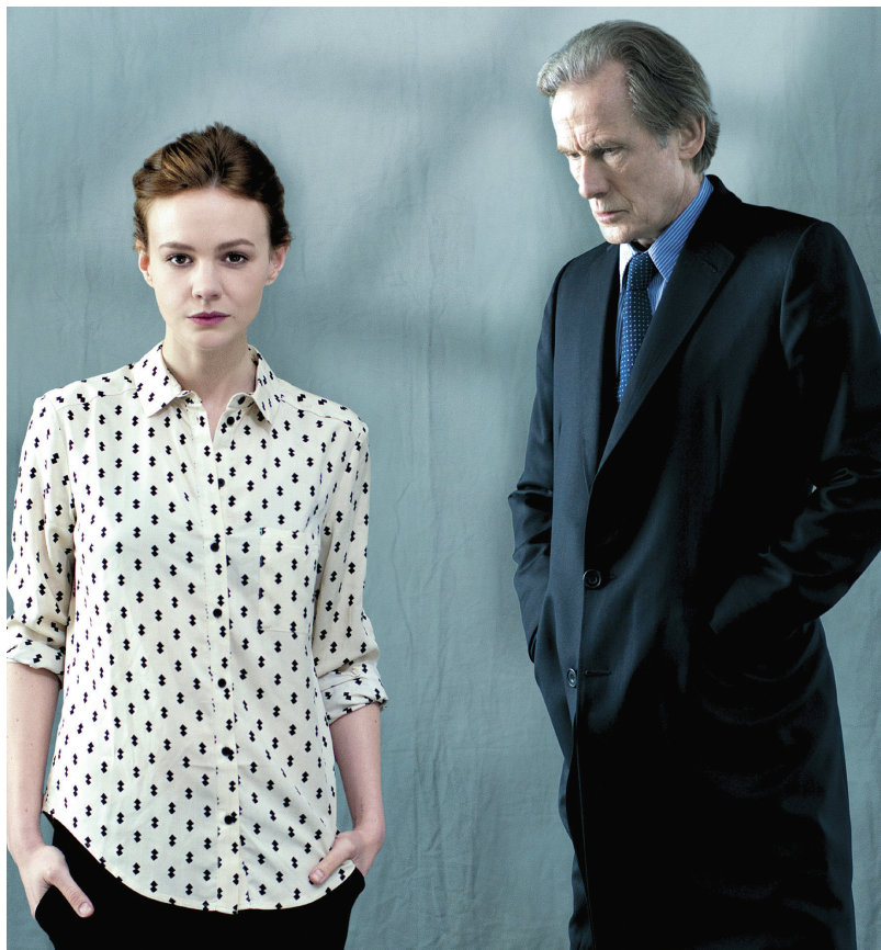
It's your last chance to catch Carey Mulligan and Bill Nighy's portrayal of two ex-lovers rekindling their past romance in David Hare's classic drama, Skylight (p. 48)