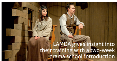
LAMDA gives insight into their training with a two-week drama school introduction

discipline they want to pursue, or for teachers looking for a broad overview, Guildford School of Acting offers the six-day 'Introduction to production skills' (4–9 August; £325). It explores set design, lighting design and technology, sound design for musical theatre, stage management and the process of taking a show from rehearsal room to opening night.