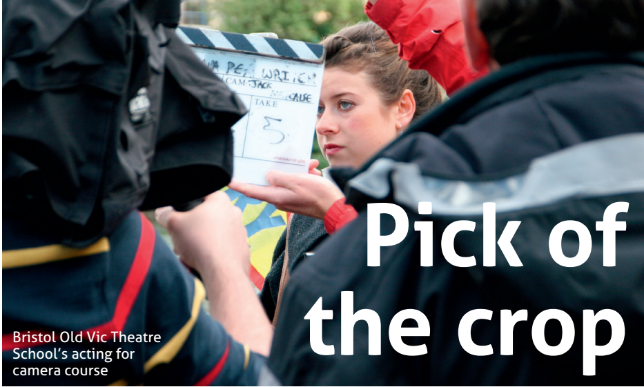
Bristol Old Vic Theatre School's acting for camera course