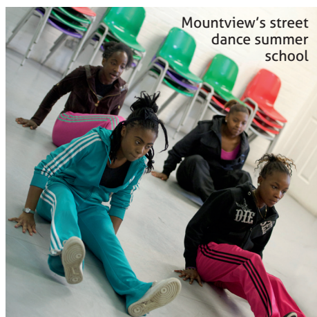
Mountview's street dance summer school