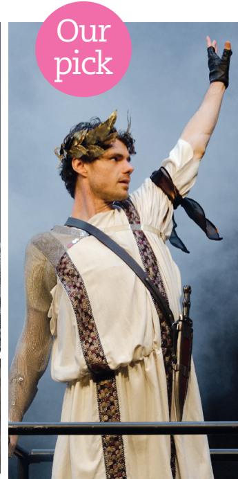
Clockwise from top: Martin Freeman will be appearing in Richard III ; Titus Andronicus ; and Shakespeare in Love