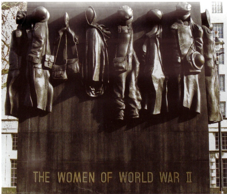
THE WOMEN OF WORLD WAR II