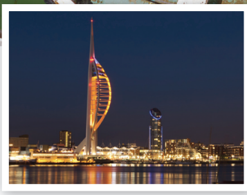
Enjoy the bright lights of Portsmouth