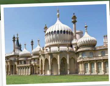
Take in the rich culture of Brighton