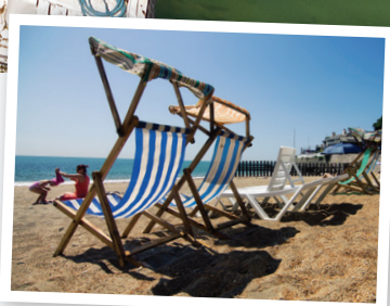
Relax on the Isle of Wight's beaches

ST IVES © ALLOU/ISTOCK/THINKSTOCK; BRIGHTON © GETTY IMAGES/THINKSTOCK; ISLE OF WIGHT © VISITISLEOFWIGHT.CO.UK