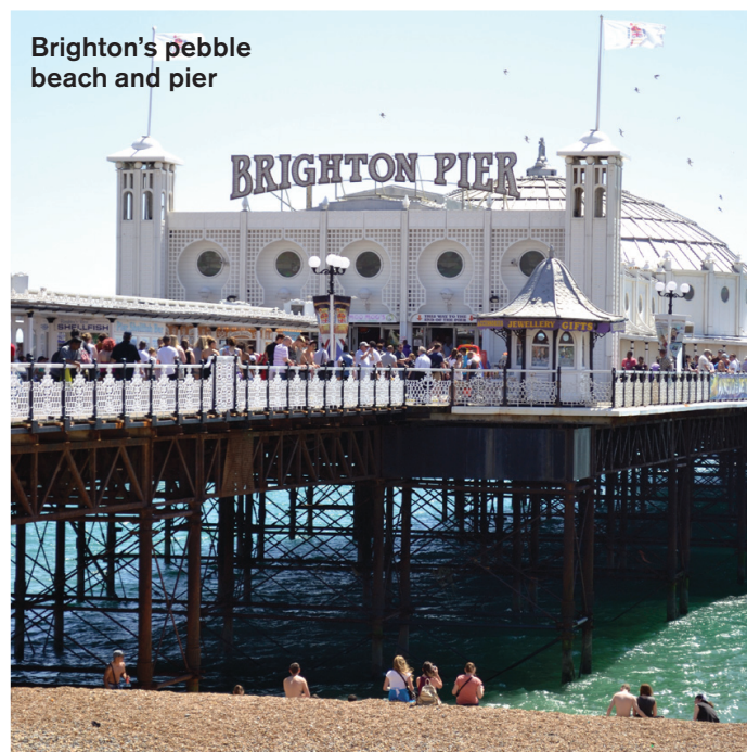
Brighton's pebble beach and pier