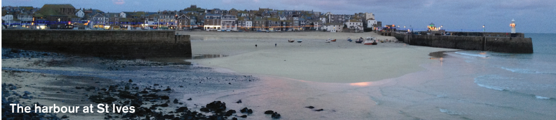
The harbour at St Ives