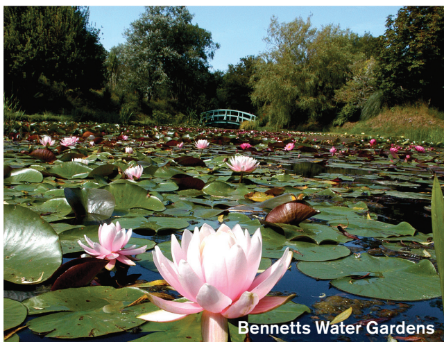
Bennetts Water Gardens