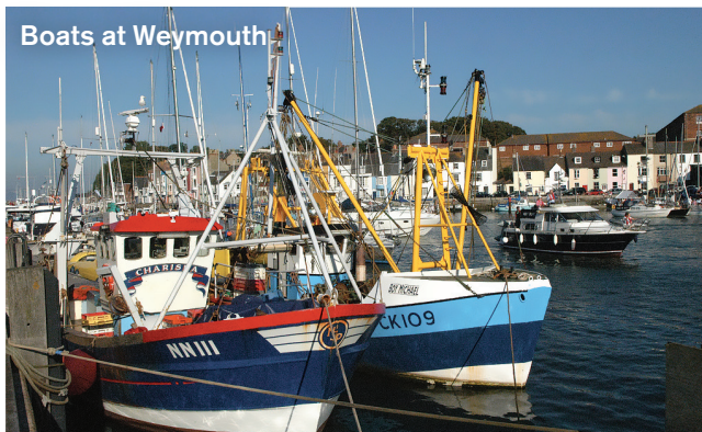
Boats at Weymouth

PORTSMOUTH IMAGE © GETTY IMAGES/ISTOCKPHOTO; BENNETTS WATER GARDENS IMAGE COURTESY OF BENNETTS WATER GARDENS; WEYMOUTH IMAGE © DORSET FOR YOU. OPPOSITE PAGE: ISLE OF WIGHT PHOTO © VISIT ISLE OF WIGHT; ST IVES PHOTO © ST IVES VISITOR INFORMATION CENTRE