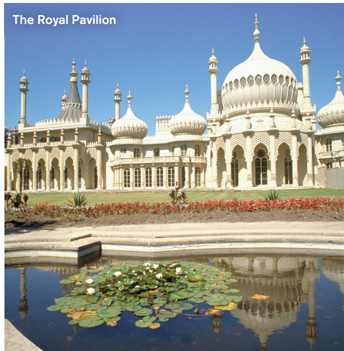
The Royal Pavilion