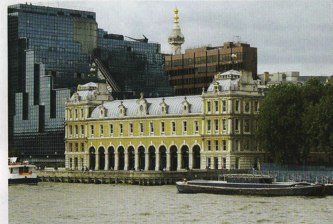
Images clockwise, left to right: Somerset House; The Albert Memorial in Kensington Gardens; The Museum of London Docklands; Old Billingsgate.

Glaziers Hall near Borough Market (p. 98). Don't miss the Bernese Games on 4-5 Aug , if you'd like to try out traditional Swiss sports. ☑ houseofswitzerland.org