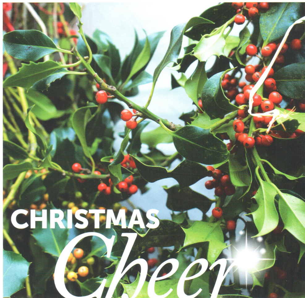
Chelsea Physic Garden

From festive shopping in unlikely locations to unusual exhibitions celebrating the joys of Christmas past, we've got the season of goodwill all wrapped up.